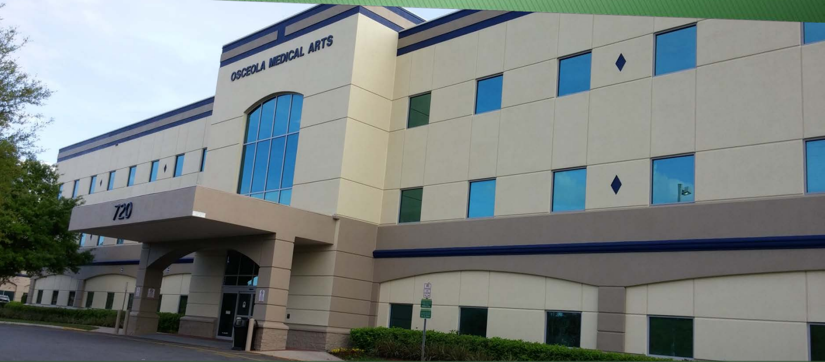
Osceola Medical Arts Building

720 West Oak Street ■ Kissimmee, FL 34741